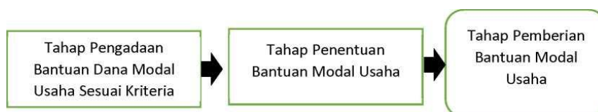
Figure2. Stages of Receiving Help

In figure 2 explain stages of accepting zakat, where the disabled who obtains business capital assistance must follow the stages that have been set up by Rumah zakat solo. That is: