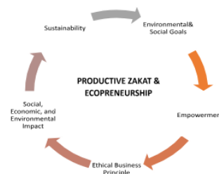
Figure 1. Productive Zakat & Ecopreneurship

In more detail, the following are the directions for productive zakat management for the development of ecopreneurship: