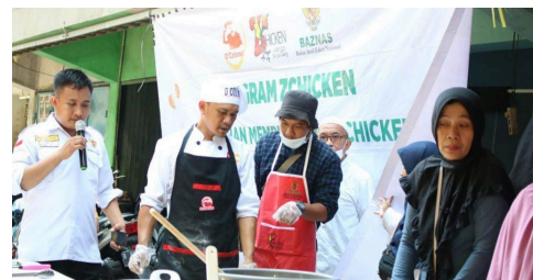
Figure 3. Activity Documentation

The National Amil Zakat Agency (BAZNAS) held training and development of the ZChicken program to improve the economic empowerment of mustahik. This training was attended by the beneficiaries of the ZChicken Program and was held at Bumi Cengkareng Indah Flat, Blok Melati 5, Cengkareng, West Jakarta, Tuesday (06/09/2022).