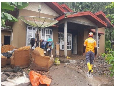
Figure 4. Activity Documentation

One of the activities carried out by BAZNAS in assisting in disasters that occurred this year in Padang, namely the National Amil Zakat Agency (BAZNAS) deployed a rescue team to help victims of floods and landslides in Agam Regency and Padang Pariaman Regency, West Sumatra.