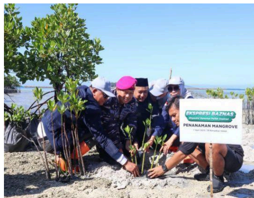
Figure 5. Activity Documentation