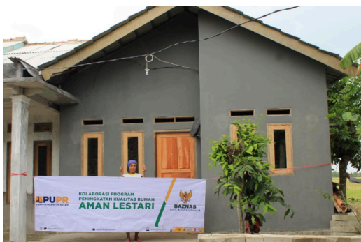
Figure 2. Activity Documentation

in 2023, in collaboration with the Ministry of PUPR, Provincial / District / City BAZNAS, and LAZ. The success of a similar program in 2022, which managed to improve 9,238 mustahik livable houses, is a reference for BAZNAS in holding this program again. The details are: BAZNAS RI managed to increase the number of houses by 1,236 units, BAZNAS Province 1,451 units, and BAZNAS Kab / City as many as 6,399 units. Meanwhile, amil zakat institutions (LAZ) also played a role by increasing 152 housing units.