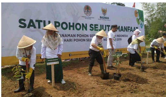
Figure 6. Activity Documentation

Not only planting, ZCD will also monitor the results of tree planting periodically, so that this activity provides positive benefits for mustahik groups, for environmental protection, and carbon emission reduction as part of climate change mitigation.