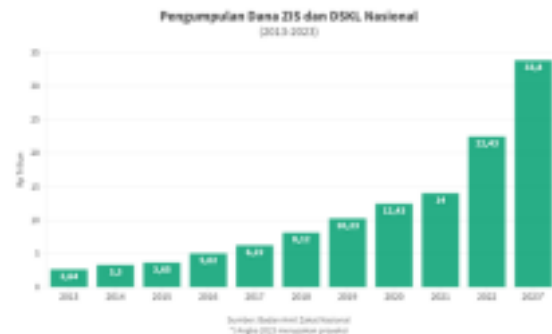
Figure 1. National ZIS and DSKL funds collection in year 2013 until 2023) (In trillion Rupiah)

requires an in-depth prior study of which asnaf are prioritized with what schemes and methods 3 .